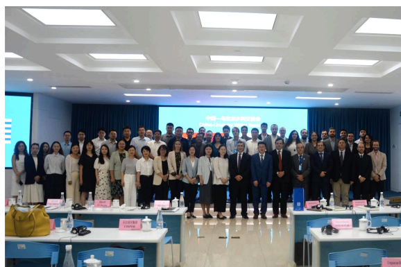
China-Uruguay Water Exchange Meeting

Forests under the Ministry of Agriculture, Water Resources and Fisheries of Tunisia, Directorate General of Water Resources under the Ministry of Public Works and Housing of Indonesia, and Institute of Water Resources Planning of Vietnam, formulating cooperation plans, identifying priority cooperation areas, and applying for