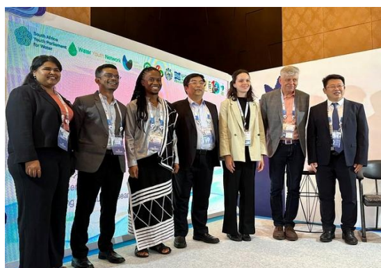
Launch of the Youth Innovation and Technology Cooperation Initiative on Water

General of the People's Republic of China in Denpasar, Indonesia, HRC signed a Memorandum of Understanding (MoU) with the ASEAN Center for Energy. HRC chief in international cooperation and training was dispatched to ASEAN Center for Energy for a one-year study visit and representatives from ASEAN countries were invited to China for technical training and exchanges, jointly planning