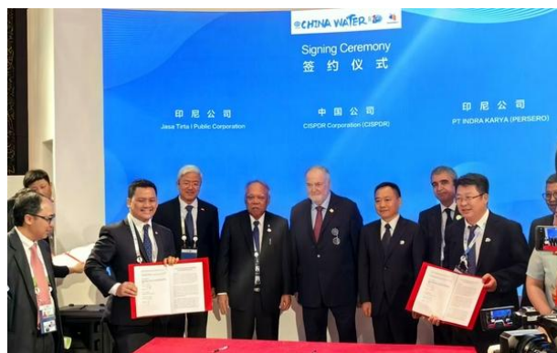
Signed MOU with the ASEAN Center for Energy

Under the witness of Li Guoying, Minister of Water Resources of