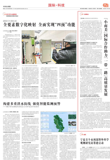
Publicity via China Water Resources News

Channels including the official website of Ministry of Water