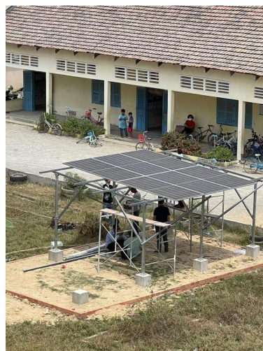
Demonstration project on off-grid solar-power system Cambodia

for the hydropower project in the Philippines and completed the solar power supply system, solar water pumping system and solar system in Cambodia. HRC has also provided a solar storage micro-grid power supply system in Peru, conducted on-site maintenance of power stations and supply of spare parts in Turkey