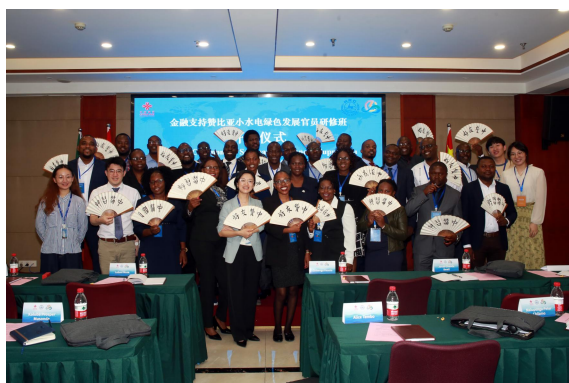
Seminar on Financial Support on Green Development of Small Hydropower for Zambia

HRC organized the China-Tunisia Water Technology Video Exchange Meeting and the China-Uruguay Water Seminar, and participated in the preparation of the signing