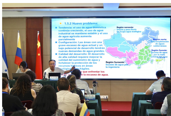
Presentation on China’s Water Governance Philosophy and Practices

in major international water events, such as the 10 th Hydropower for Today Forum, the 3 rd Asia International Water Week, the 2024 Qingdao International Water Conference & Expo, the Taihu International Conference on Water Management, etc. HRC also organized the China-Uruguay Water Seminar