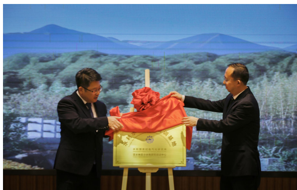
Unveiling of China-aid Training Base for Water Conservancy and Hydropower

and Oceania attended those programs, including government officials and technical experts in the fields of water conservancy,