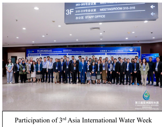
Participation of 3 rd Asia International Water Week

In 2024, HRC actively organized and participated in various conferences, including the 10 th World Water Forum, the 6 th United Nations Environment Assembly, the 10 th Hydropower for Today Forum, the 2024 Qingdao International Water Conference & Expo (Global Platform For Water Solutions), the ASEAN Renewable Energy Week, the 3 rd Asia International Water