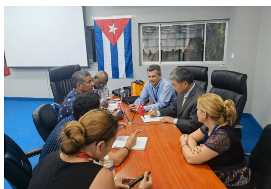
Cooperation exchange with Unión Eléctrica de Cuba (UEC)

in 2023, HRC provided technical training on water resources and power for 6 Honduran participants from National Electric Power Company and other organizations. In order to follow up the conference