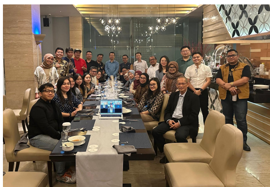
Reunion of Former Participants in Indonesia

The special report on “China’s Water Governance Philosophy and Practices” has been introduced into these training programs. Furthermore, HRC invited participants to take part